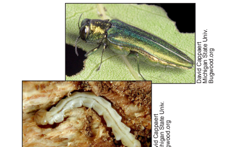
EAB adult (top) and larva.