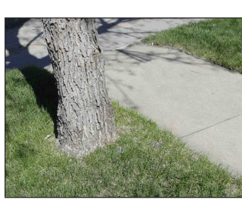
These poorly sited trees will eventually interfere with the sidewalk (above) or the overhead wires (right).