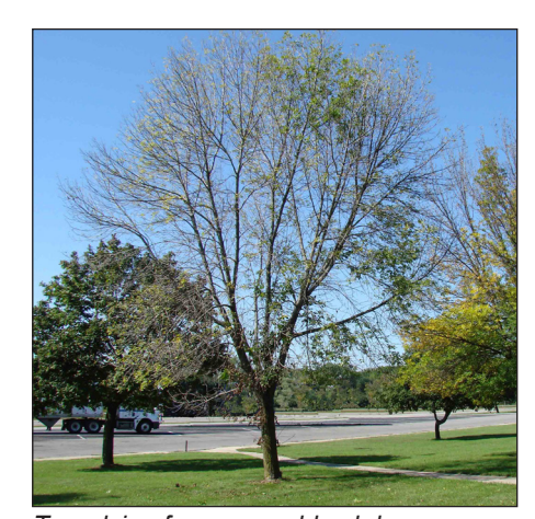
Tree dying from emerald ash borer.