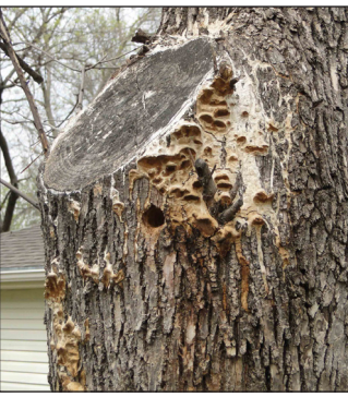
Trees in poor health are generally not suitable for treatment. Left: Extensive dieback; Right: Decay around pruning cut.