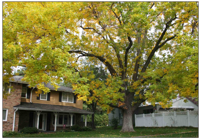
Ash trees provide shade, autumn color, and many other benefits that enhance the value of a home.

The cost of treatments can be considerable. This publication provides guidelines to help you evaluate your tree, discusses options for treatment, and provides information on replacing ash trees with other species.