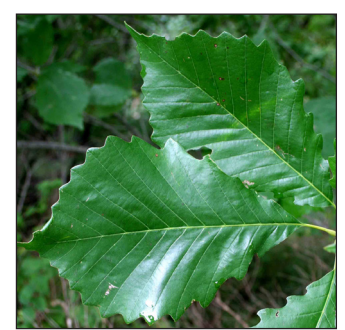
Chinkapin oak leaves