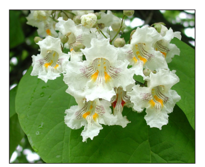
Northern catalpa flowers

Visit your local city park or arboretum to see a variety of trees growing under local conditions.